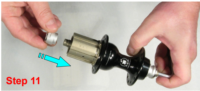
Insert Campy side cap to axle.