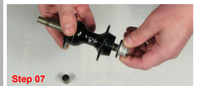
Insert Campy left side cap.