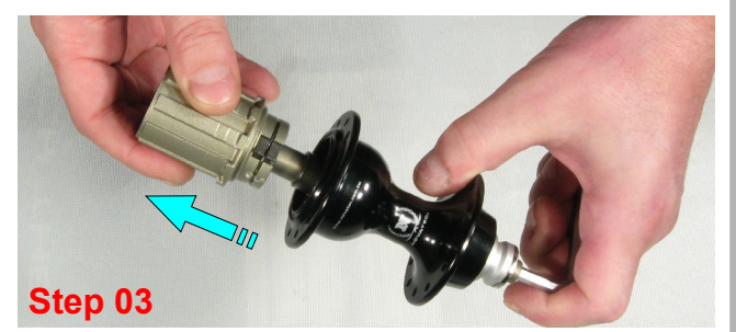
Remove Shim. Cassette body.