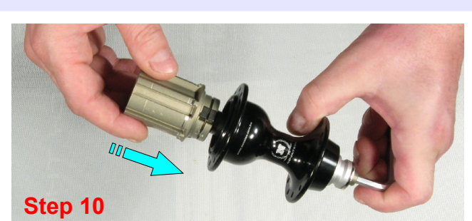
Insert Campy cassette body to axle.