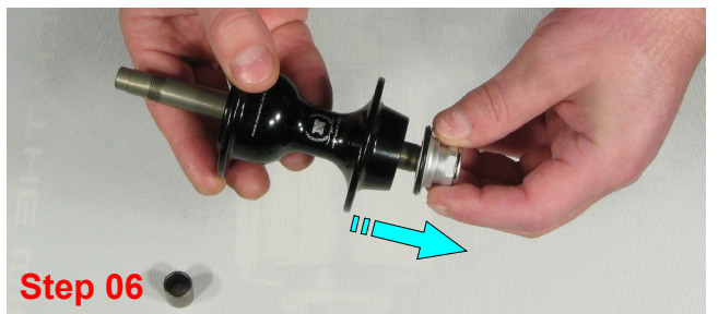
Remove Shim. left side cap.