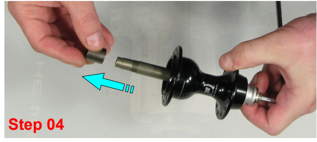
Remove CrMo spacer.