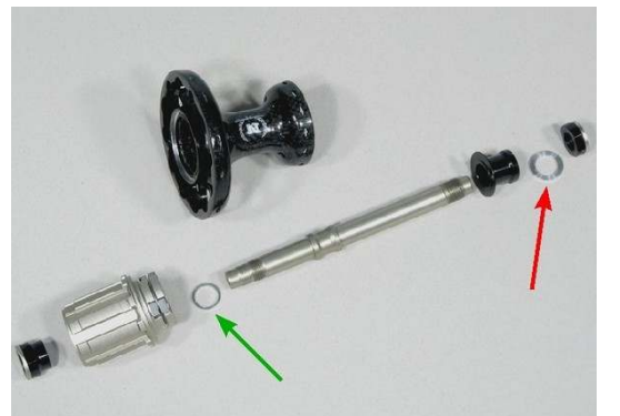
Step 07 Position of Washer 199 & Washer 197. This position is using only for Shim. type !!!

Step 06 Take a part axle & cassbody. Remember position of Washer 197 !!! This position of Washer 197 is only for Shim. !!!