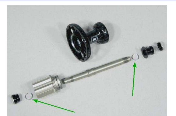
Step 07 Check well position of 2pcs Washer 197 for Campy type !!!