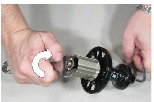
Step 12 Insert allen key into axle & hold it. Tight side cap by wrench key by clockwise direction.