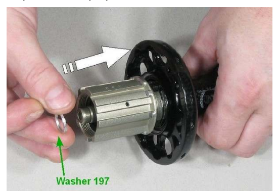
Step 11 Insert into axle cass.body & then insert Washer 197. This position of Washer 197 is only for Campy !!!

Insert allen key to axle & hold it. Tight side cap by wrench key by clockwise direction.