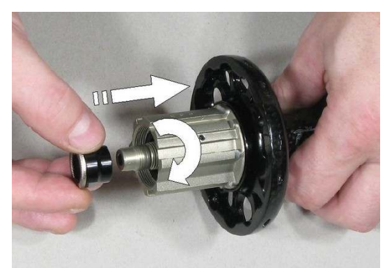
Step 11 Insert side cap into axle & screw it in by clockwise direction.