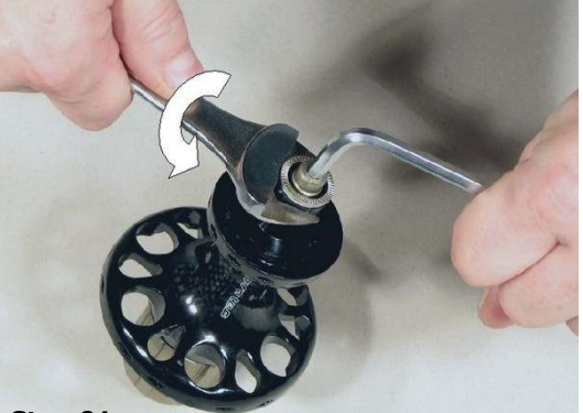
1pc of Wrench Key 17mm 1pc of Allen Key 5mm