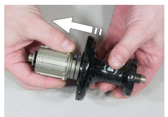
Step 03 Remove axle with cass.body from hub shell.

Remove all three parts of side cap. Middle part of side cap is Washer 199 which is using only for Shim. type!!! Remember position of Washer 199 well.