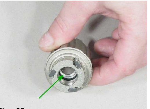
Step 05 Washer 197 is mostly hidden in cassbody.

Insert allen key into axle and hold it. Unscrew side cap by wrench key by anticlockwise direction.