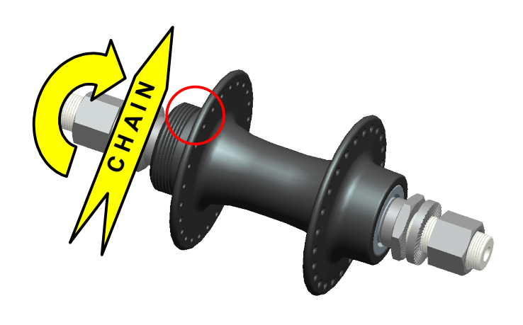
O.L.S.T. = One Left Side Thread

Standard Flip-Flop is 1.37" + M30 This hub is good for left hand riders or for standard bikes and rider can mount at hub sprocket to each side with different number of teeth and later easy exchange to sprocket which he wants to use.